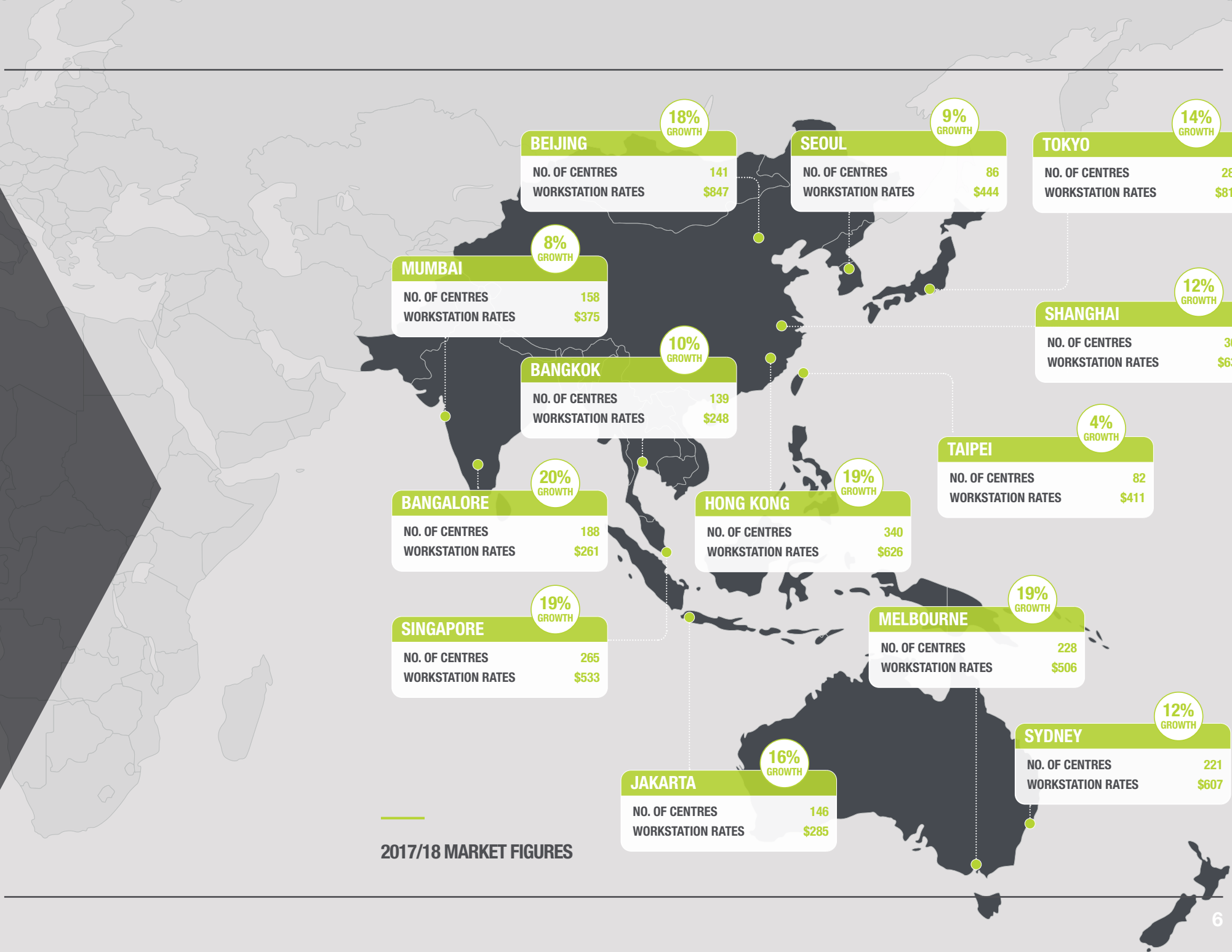
2017/18 MARKET FIGURES