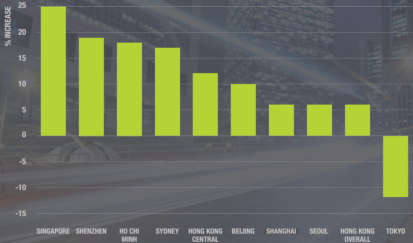
CONVENTIONAL OFFICE RENT GROWTH FORECAST 2017 - 2019

WEWORK IS EXPECTED TO DOUBLE ITS PRESENCE ACROSS ASIA-PACIFIC WITHIN THE NEXT 18 MONTHS