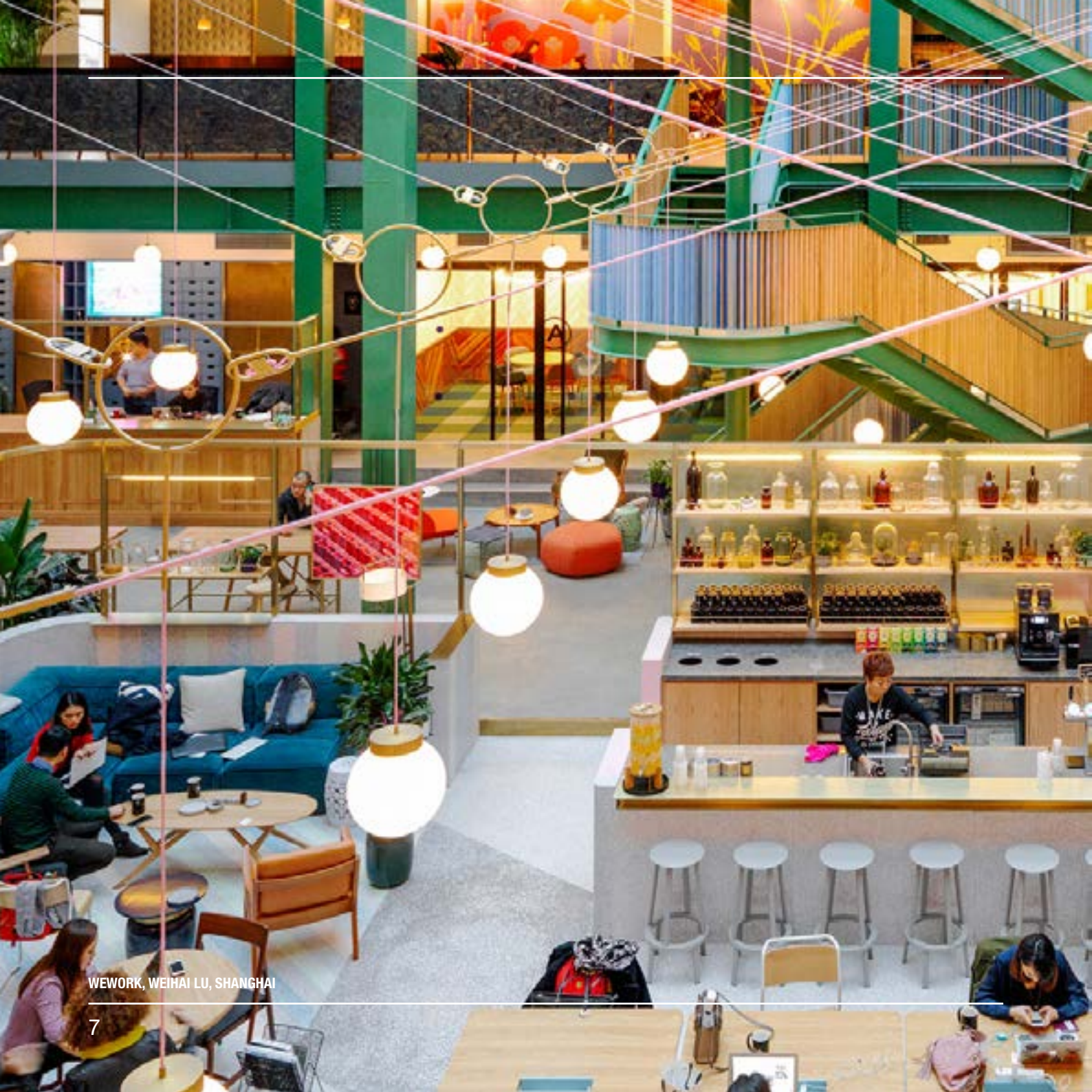
WEWORK, WEIHAI LU, SHANGHAI